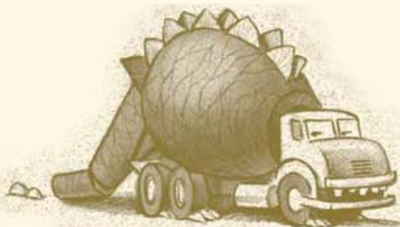
This dinotruck releases cement.