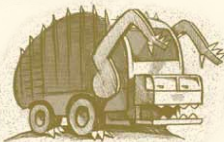
This dinotruck collects garbage.