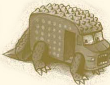
This dinotruck delivers packages.